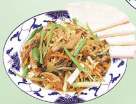
Moo Shu Pork