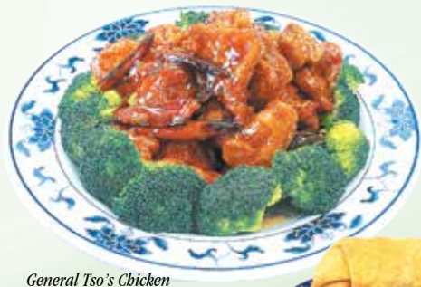
General Tso's Chicken