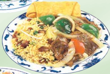
Pepper Steak Combo