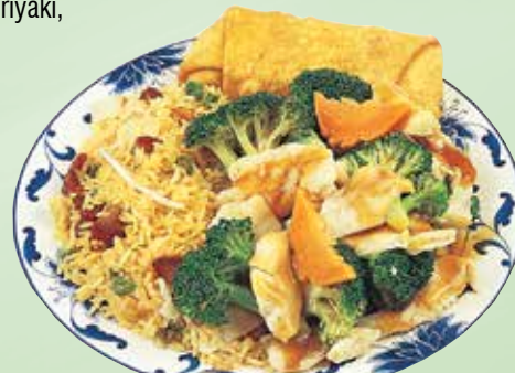
Chicken w. Broccoli Combo