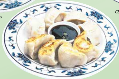
Fried or Steamed Dumplings