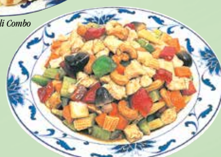
Chicken w. Cashew Nuts