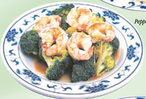
Shrimp with Broccoli